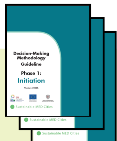
Figure 1. A manual for each phase has been elaborated