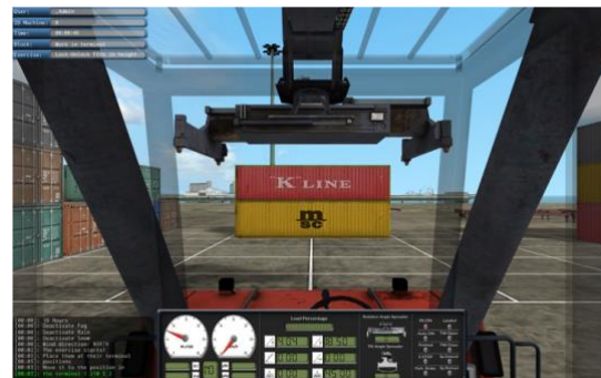
View from the operator's cabin