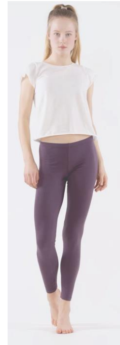
YOIQI Scarabeus Cut N Fit