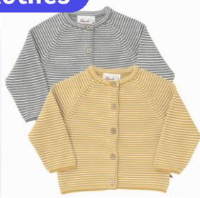
PWO Caico Cotton