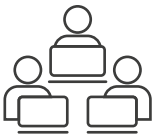
300 researchers and ICT specialized staff