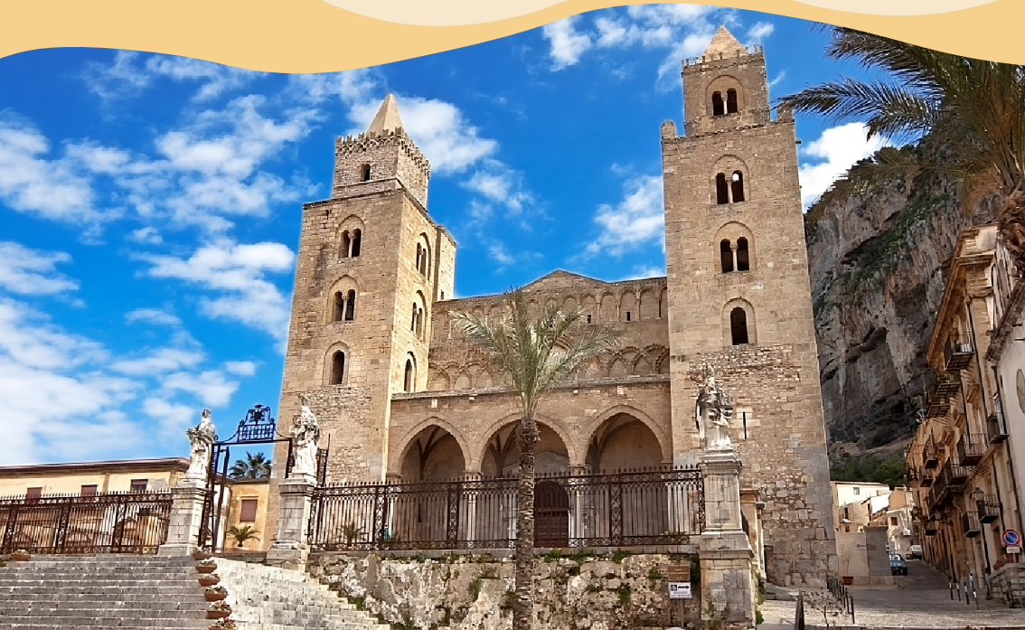
Cathedral - Cefalù