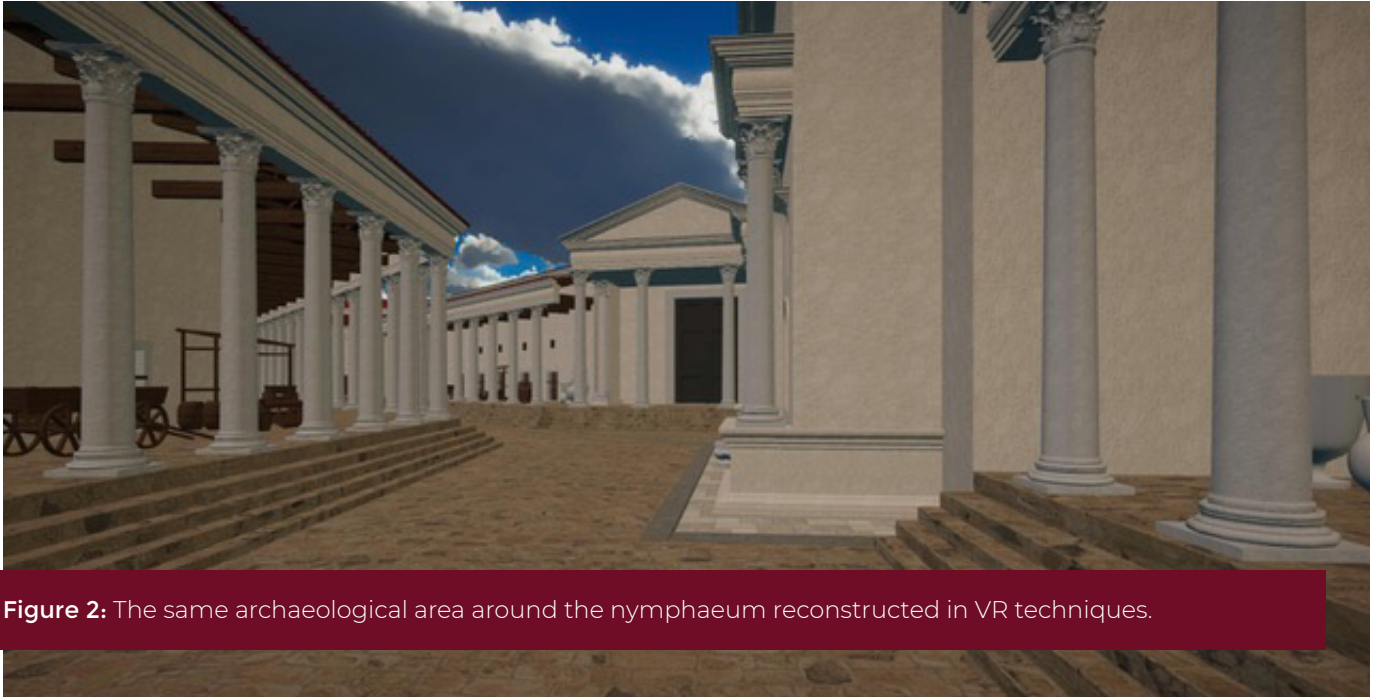
Figure 2: The same archaeological area around the nymphaeum reconstructed in VR techniques.

In 636 A.D., Byblos came under the control of the Arabs, with whom new cultural requirements began to affect the city's urban landscape. But it wasn't until the arrival of the Crusaders in 1104 that Byblos' classical appearance disappeared for good, giving way to other cultural norms that would mark its development for centuries to come. The city shrank in size and was surrounded by new defensive walls dominated by a castle, the ruins of which are still visible within the archaeological site.