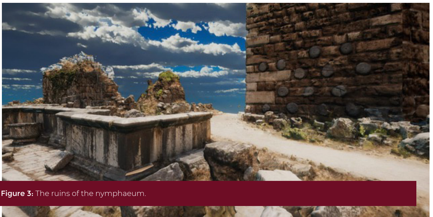
Figure 3: The ruins of the nymphaeum.

The transformations that have shaped the face of this thousand-year-old city have continued to evolve over the years. And with its historical remains completely buried under the rubble, ancient Byblos fell completely into oblivion. It was only at the beginning of the 20th century that the city regained its importance, with the various archaeological missions working on the site and the rich discoveries tracing its history. In 1984, it was listed as a UNESCO World Heritage Site.