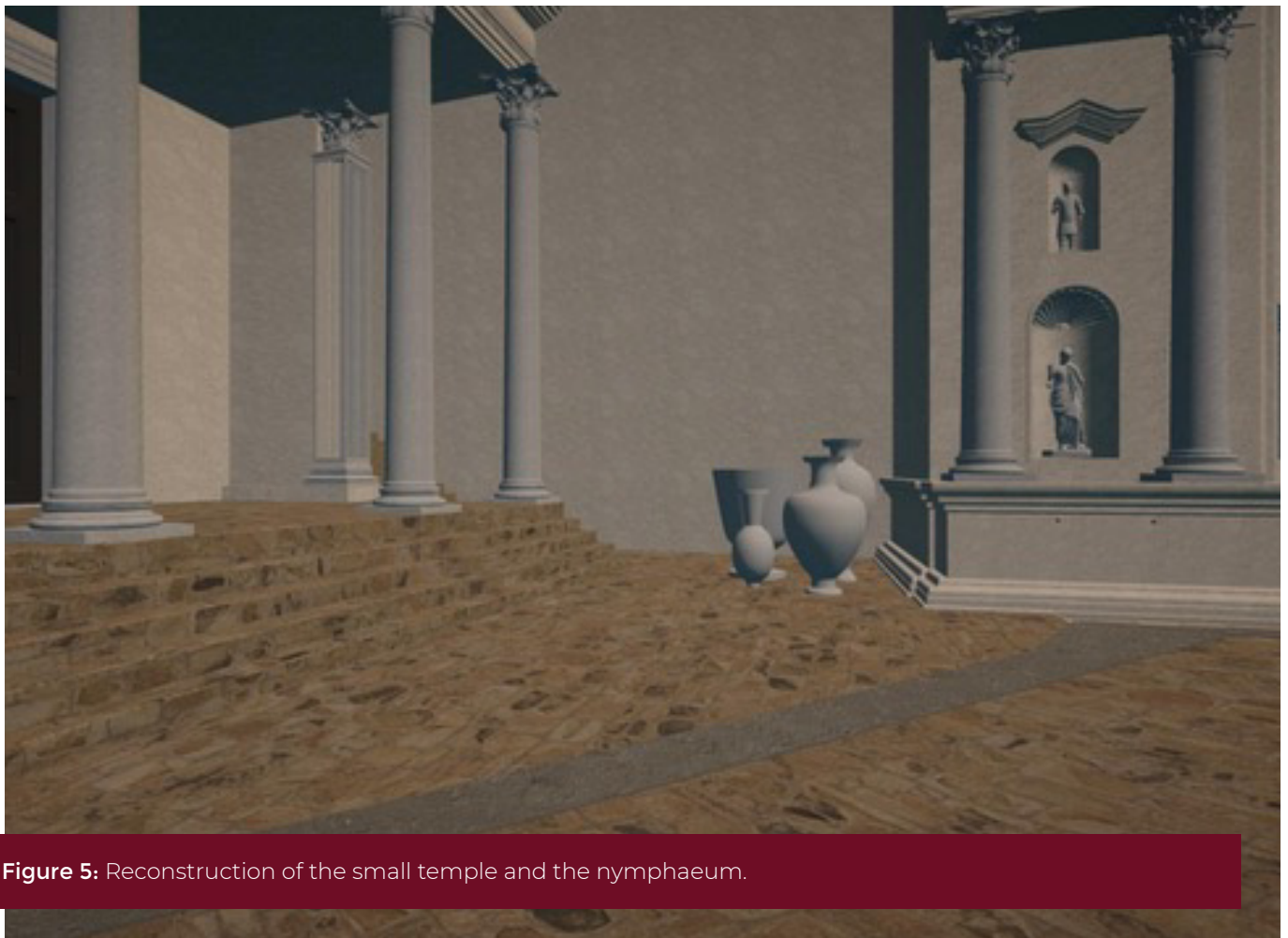
Figure 5: Reconstruction of the small temple and the nymphaeum.

However, it should be noted that our intervention does not claim to find all the answers concerning the architectural and historical aspect of the Roman Byblos but it nevertheless tries to clarify certain points in the light of the available data.