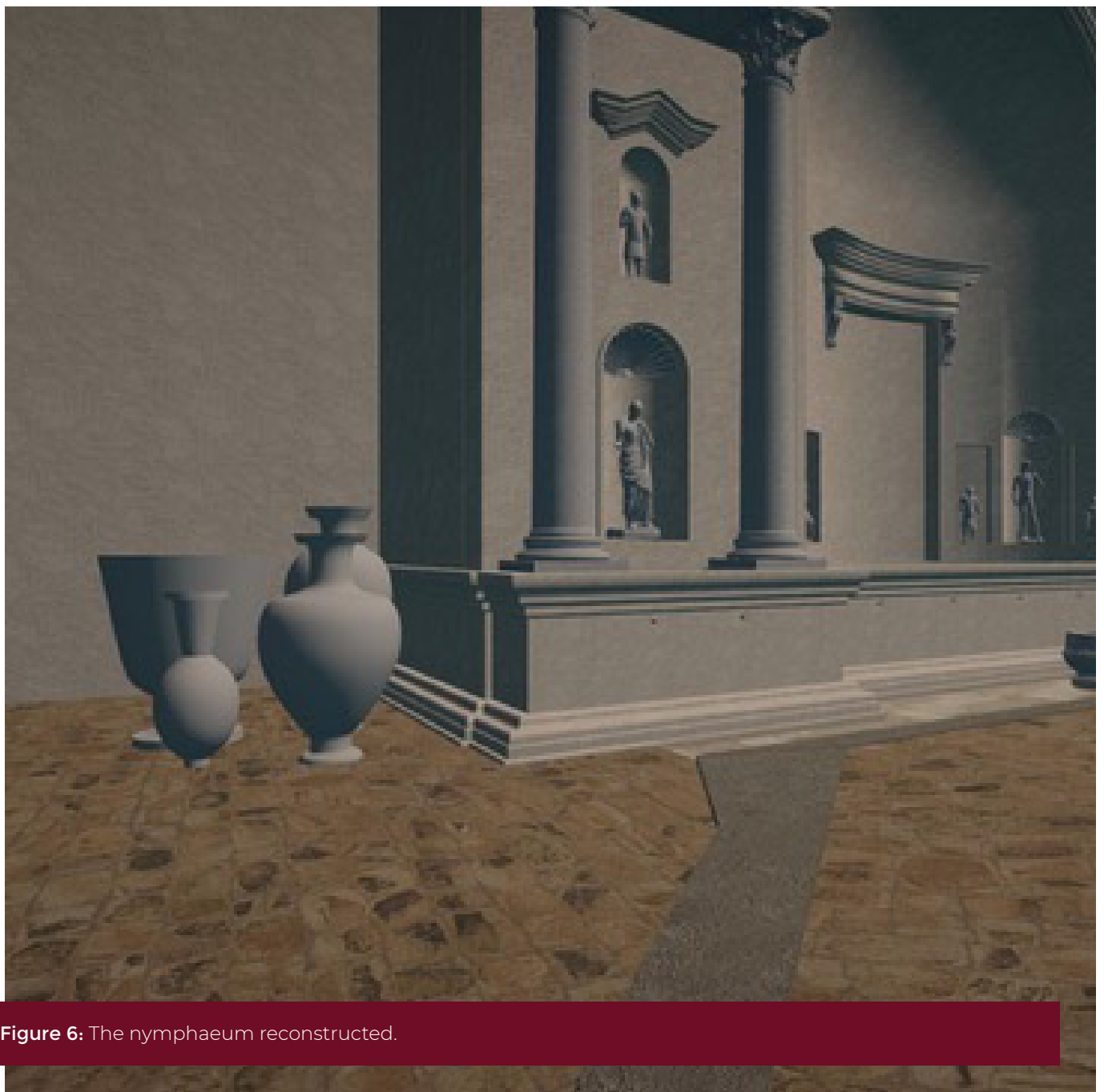
Figure 6: The nymphaeum reconstructed.

built on the ruins of a previous one. We can therefore imagine the difficulties encountered by the archaeological missions that worked on site in the early 20th century. Knowing that their main objective was to uncover the prehistoric levels of Byblos, these missions ended up scarifying parts of the Roman stratum and its monuments to achieve their ends. As members of the iHERITAGE project team, our mission was to shed light on this marginalized era, in line with the methodology already mentioned.