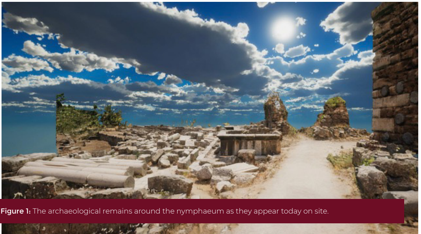
Figure 1: The archaeological remains around the nymphaeum as they appear today on site.

The Greek occupation came to an end as the Roman legions swept into Byblos around 64 BC. Under their gaze, Byblos underwent an exceptional architectural revival befitting its newfound status as the "Ieras Byblou," or "Holy City" and matching the new ideals of architectural perfection and standardization. The prestigious appearance of Roman Byblos did not survive the Byzantine era, during which a disastrous earthquake struck the city in 551 AD, affecting both its monuments and its population.