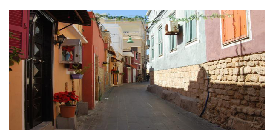
Figure 4. Tyre old city's routes

The souk situated next to the Christian district is a lively and atmospheric marketplace.