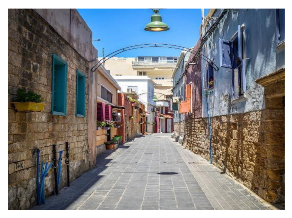
Figure 5. Tyre old city

Its traditional fabric, which primarily dates from the Mameluke and late Ottoman eras, maintains a degree of uniformity. This 13-hectare region contains 3,600 residents divided between Muslim and Christian areas, the majority of which are original Tyre residents with poor income. The fishermen's community makes up around a quarter of the population in the ancient city (Debs et al. 2015).