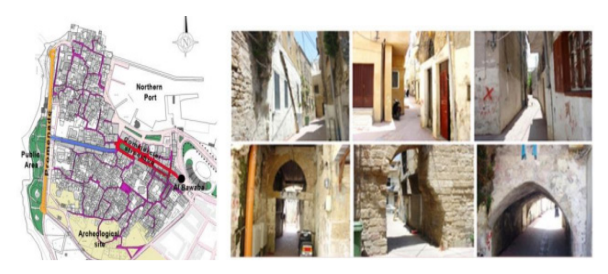
Figure 6. Heritage conservation ideologies analysis (Zaeyter and Mansour, 2015)

A pedestrian network connects a few areas of the ancient city. Urban blocks with a maximum width of three meters generate limited pedestrian routes.