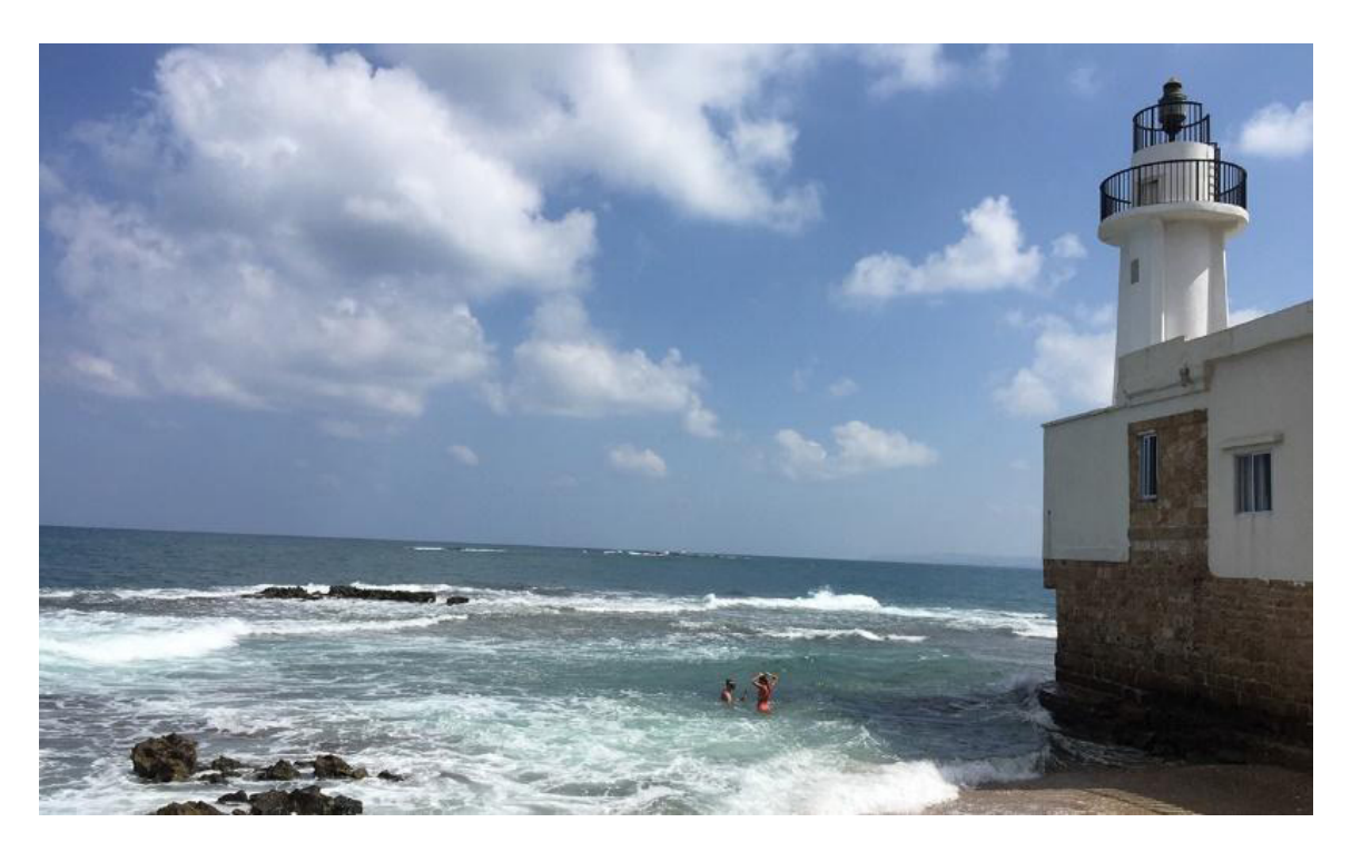
Figure 2. Tyre lighthouse