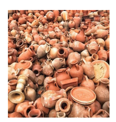
Figure 12. Artisanal work in Tyre