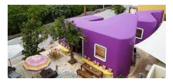
Figure 3. Tyre guest house

Tyre hosts more than 30 hotels and guest houses.