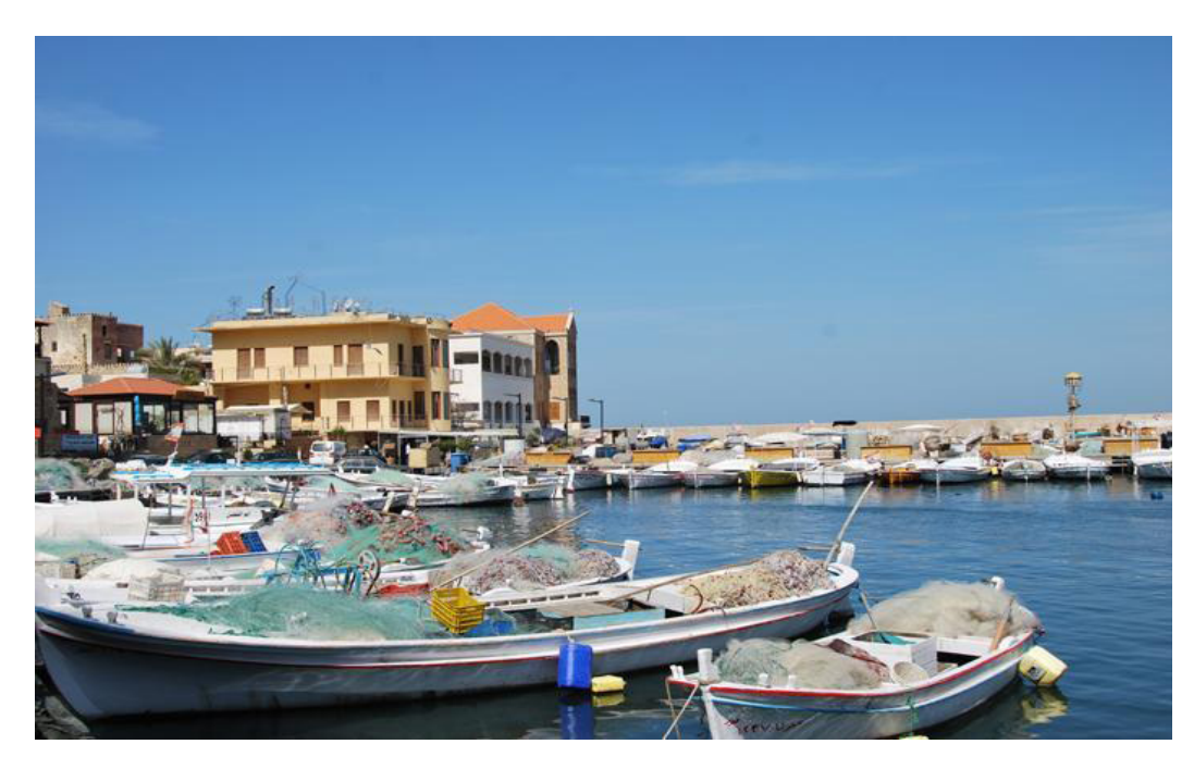
Figure 10. Tyre port