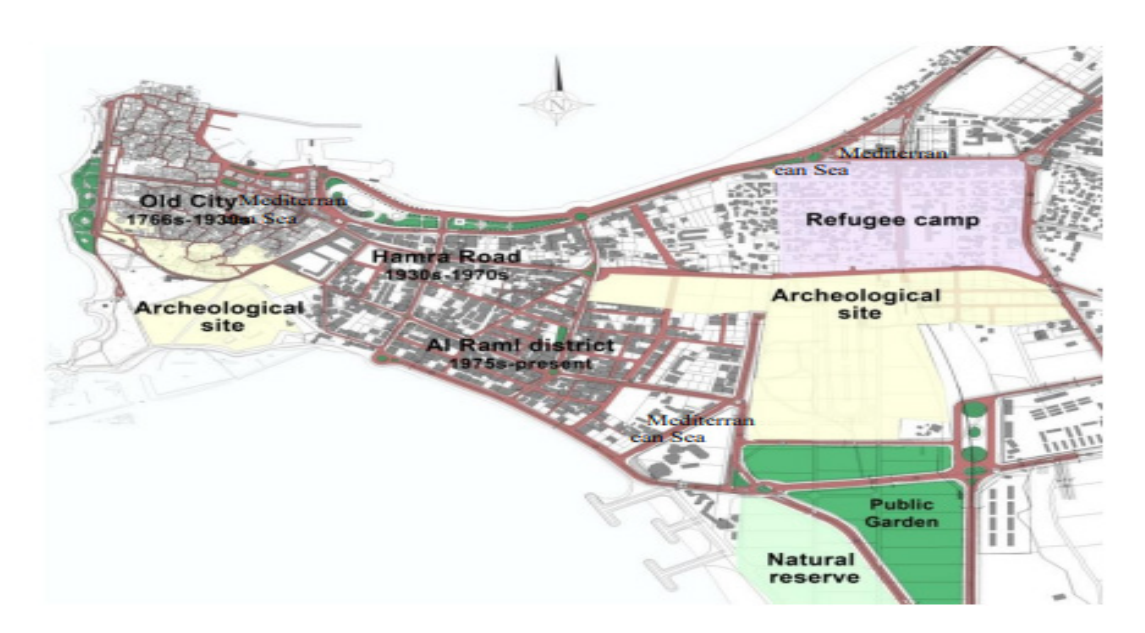
Figure 7. Current plan of Tyre city, showing the morphological study of the urban tissue of Tyre (Zaeyter and Mansour, 2015)

Tyre International Festival has been bringing Arabic music to South Lebanon since 1996. The event takes place every year in the Al-Bass archaeological site in Tyre, which includes a vast Roman necropolis (old cemetery) and a stadium.