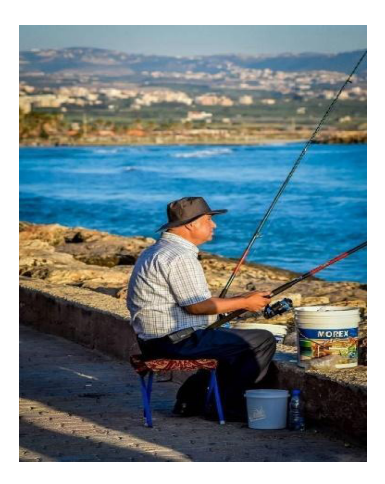
Figure 13. Fishing in Tyre

In addition, two itineraries for the city were proposed to focus on the visit of the archaeological sites, the western seafront, and the harbor. The first proposed itinerary starts with the archaeological site in al-Bass and proceeds to the archaeological site south of the island followed by the Crusader cathedral.