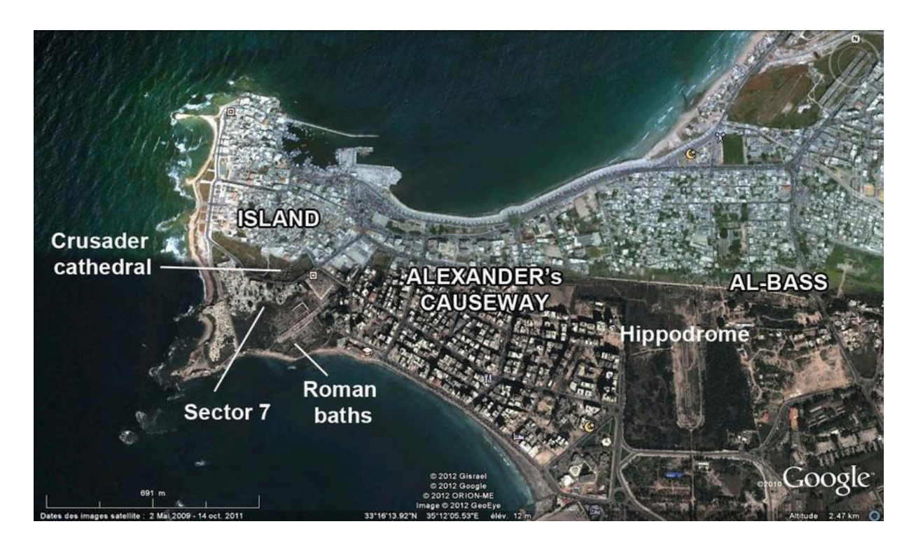
Figure 1. Tyre coast map

Tyre serves as a regional center with growth potential. The rich cultural heritage and significant international interest guaranteed Tyre a position on UNESCO's World Heritage list in 1984. Moreover, its proximity to Qana and other archaeological/Biblical zones in the area, as well large stretches of sandy beaches make it a favorable node in the various types of tourism. This archaeological heritage, together with the city's natural heritage, has designated Tyre as a tourism hotspot, allowing for a variety of cultural, leisure, or religious touristic activities (Zeayter and Mansour, 2015).