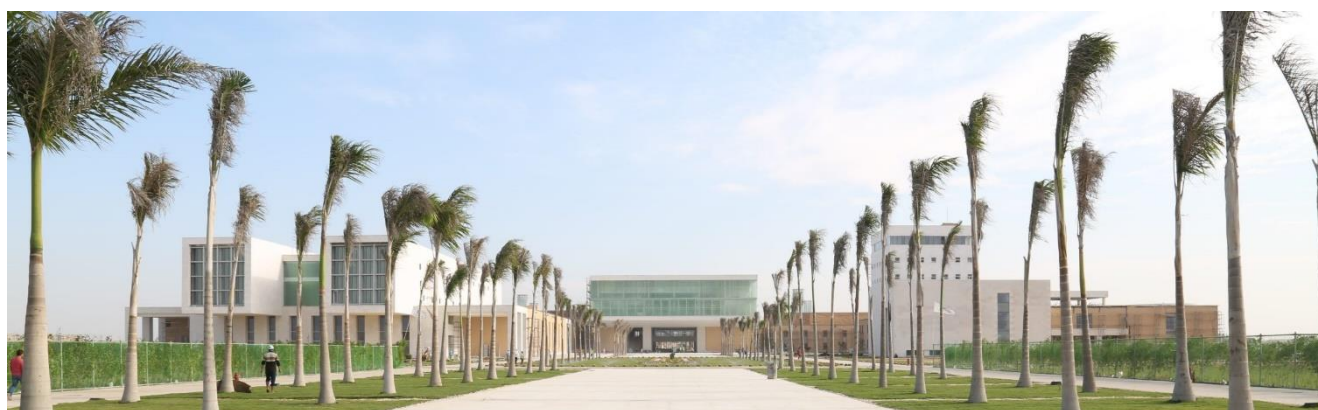
Egypt-Japan University of Science and Technology (E-JUST) main campus

There is a strong relationship between both governments where they both divide the cooperation cohesively to ensure positive results. E-JUST consists of the Faculty of Engineering and the Faculty of International Business and Humanities.