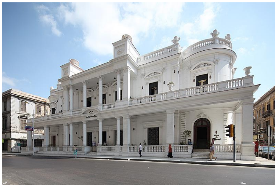
The Egyptian Case Study “Horreya Center for Creativity” in Alexandria