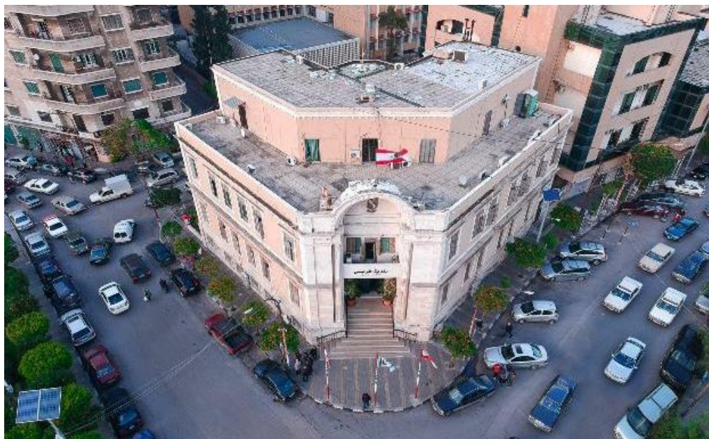
Drone picture of the Municipality of Tripoli

Two pilot buildings were selected in Tripoli city: the Municipality of Tripoli and the Rachid Karami Municipal Cultural Center.