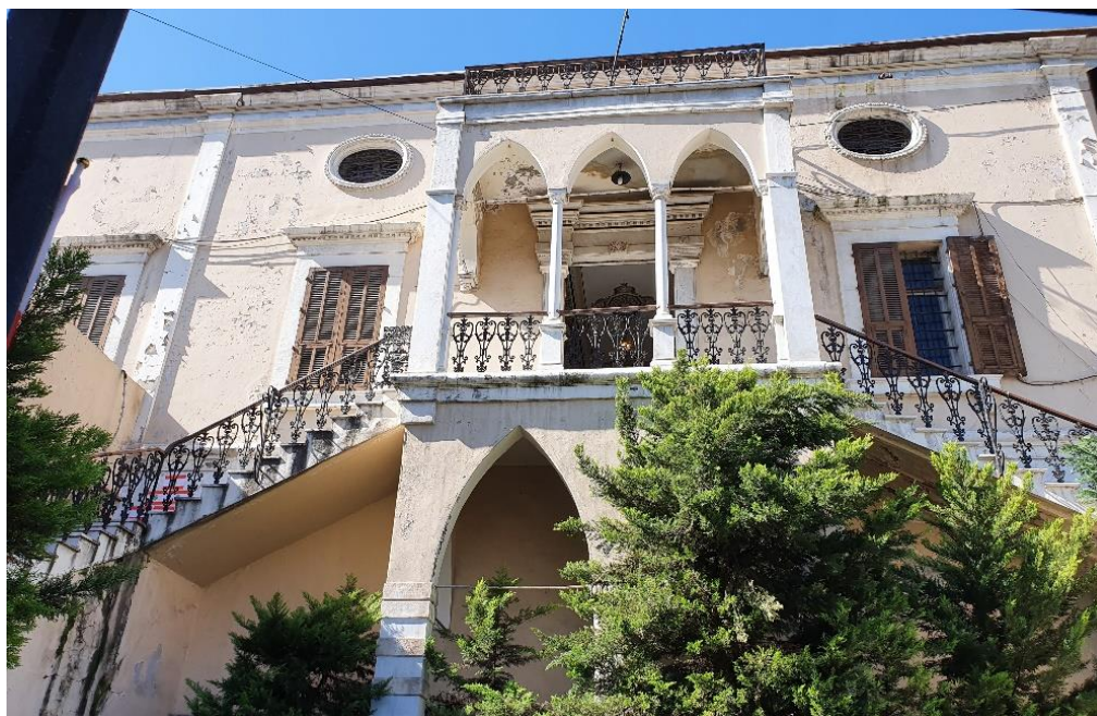
Rachid Karami Municipal Cultural Center