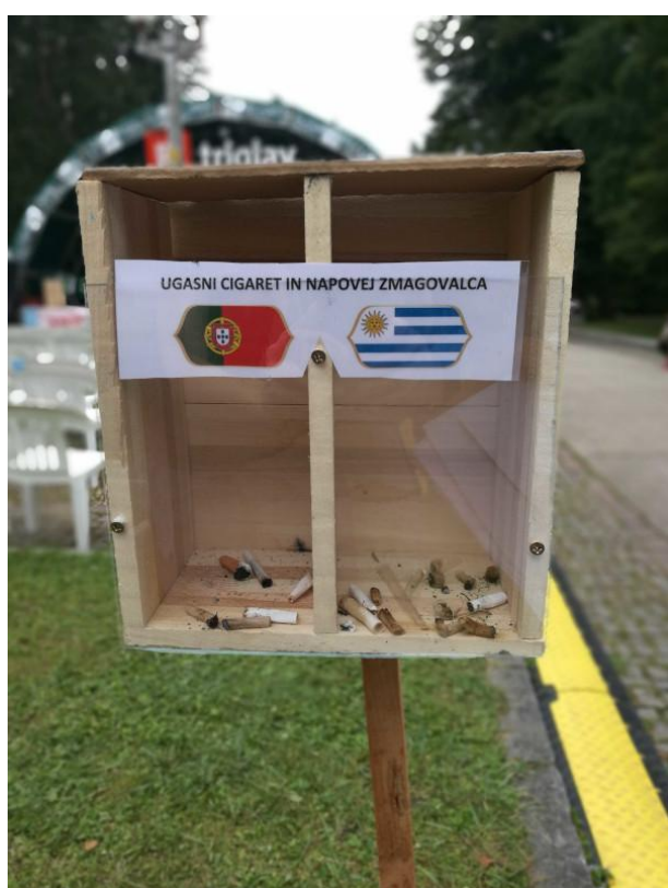
Waste collection need not be dull, EBM, 2019

With a waste reduction plan and the roll-out of financial and social incentives that are adapted to citizens and businesses, everyone benefits. When both businesses and citizens are financially incentivised to produce less waste, they will be able to lower the costs they previously paid for waste management. Social incentives are further giving a sense of belonging and sustaining the local economy.