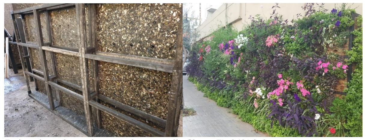
Ecoboards used to make vertical green walls

One of the outputs of the recycling process is 'ecoboards', a durable building material made from inert materials (mostly LDPE), used to make vertical green walls or street recycling bins. It is a good example of how circularity can be improved locally. Over a 3 year period of consecutive operation of the facility, the average incoming weight per month was 458 tonnes<sup>36</sup>, which would be otherwise disposed of in a landfill. Thus the system creates more jobs while putting materials back into the economy. It is also around 50 % cheaper than the city's previous contract — the city now pays just $62 per ton, as opposed to $130<sup>37</sup>.