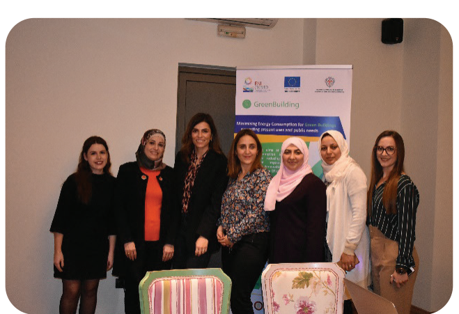
Women in Power