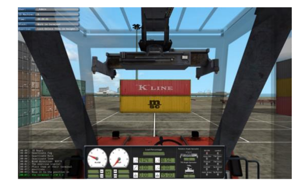
View from the operator's cabin