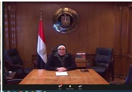
Dr. Nivine Gamea Minister of Trade & Industry