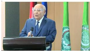
Amb. Raouf Saad Deputy Minister of Foreign Affairs