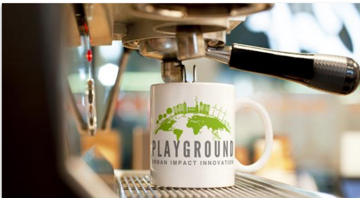
Image: A Playground logo on a cup at the Innovation zone’s meeting hub – an idea to increase engagement.

Branding. Good branding is part of the essence and identity of the Playground. A strong brand conveys vision, values, and uniqueness. It builds credibility, fosters recognition, and attracts stakeholders. Effective branding is the linchpin that transforms the Playground from a concept to a recognized, trusted, and influential force for urban change. It is important to brand the Playground as part of setting up the physical infrastructure, so the area is distinct and recognizable. It is also necessary to create a brand book and branding assets that will be used across all engagement points of the Playground.