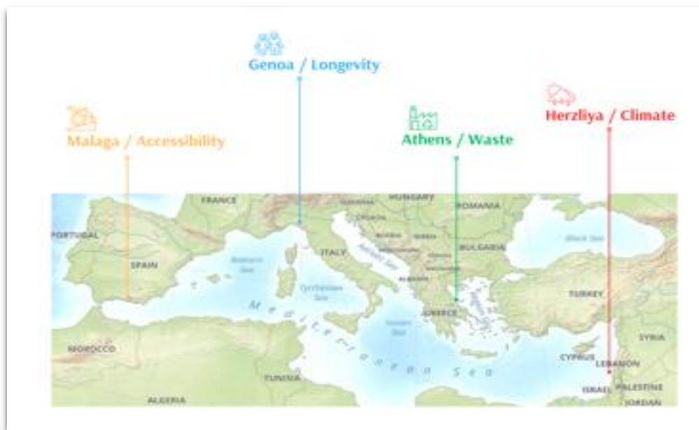
Image: Imagining an international global network of 'Playgrounds' that share the same methodology and tools but address different social and environmental issues.

The Playground is not limited solely to urban sustainability. One of the core objectives of The Playground is to become an international global network of 'Playgrounds' that share the same methodology and tools but address different social and environmental issues. The Playground could potentially be an area where topics like accessibility, waste management, housing and green building, cultural preservation, public safety, aging population, food security and so many more are developed, tested, and scaled to the whole world.