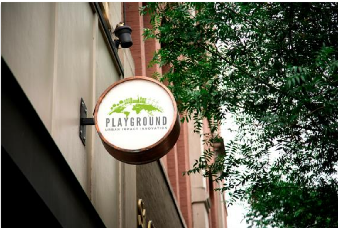
Image: A Playground sign that can be placed at the entrance to the Innovation zone's meeting hub.

an international global network of 'Playgrounds 'that share the same methodology and tools but address different social and environmental issues