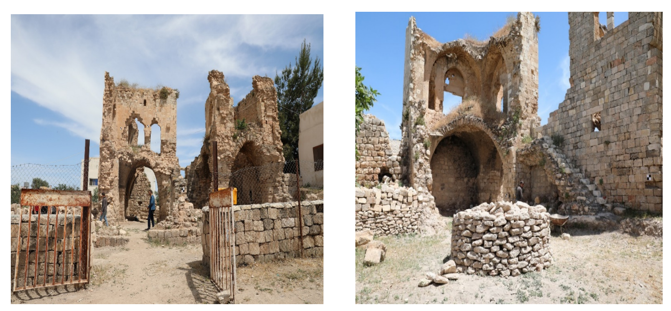
Figure 1 Klaib Basha House (Saraya)