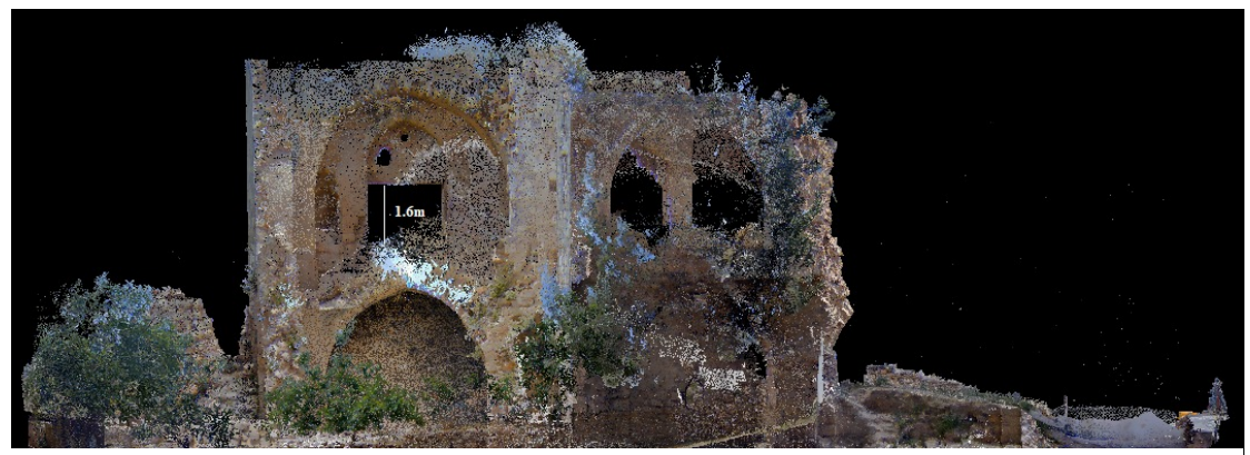
Figure 6 show 3d Perspective of interior spaces