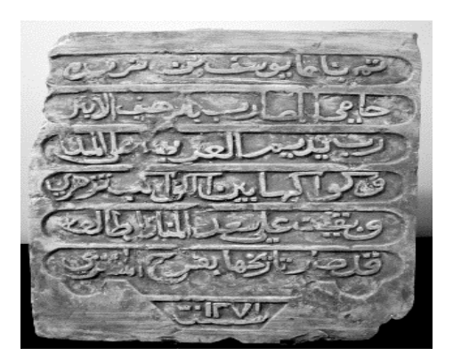
Figure 2.. show An old picture of the foundation stone in Al-Saraya (Al-Alali) sh owing the date of construction

Thus, his guest house became equal to the strength and action of the Saraya, but rather surpassed it in all that it does and is distinguished by the institution of civil and legitimate government. It was also (Klaib Basha Saraya) gathered people of knowledge, literature and poets and served as an education center in the mosque that was built by Sheikh Klaib and attached to Saraya to be a beacon of knowledge and knowledge. Figure 2.. show An old picture of the foundation stone in Al-Saraya (Al-Alali) showing the date of construction