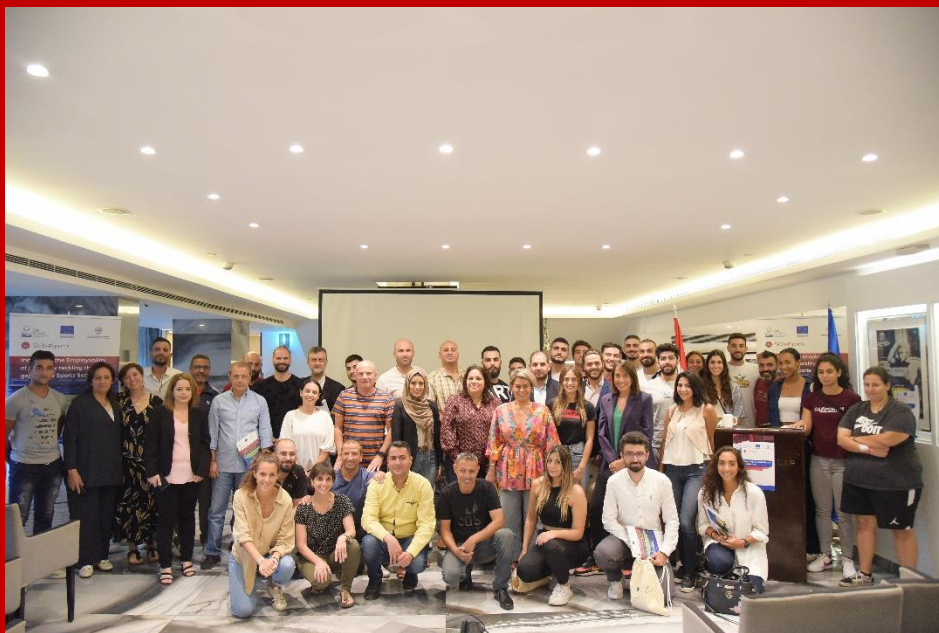
The Rene Moawad Foundation hosted the 2nd Cross-border Capacity Building Workshop in Lebanon.

and to contribute to building a responsible civil society that reinforces democratic values, justice, pluralism and moderation.