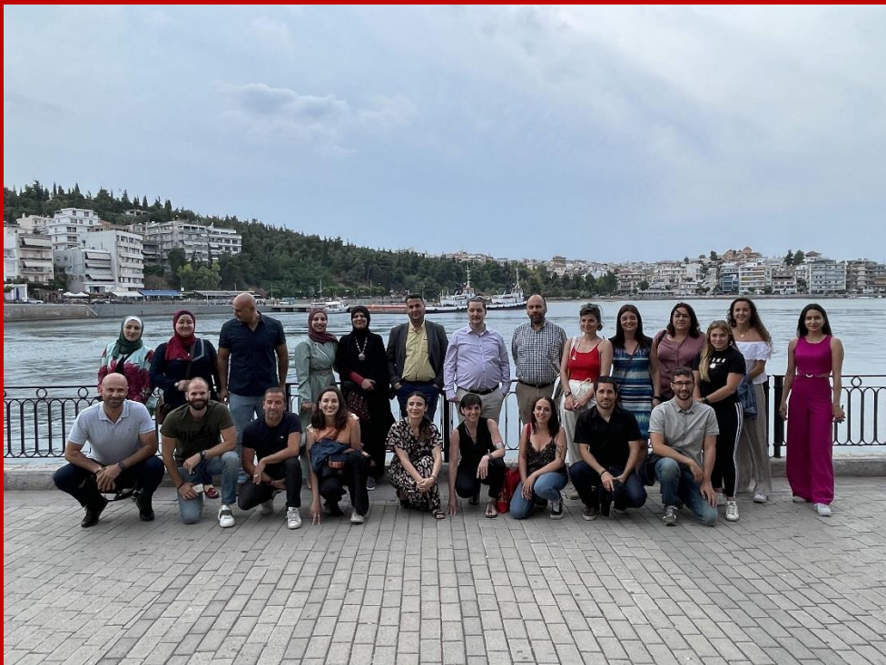
Development Agency of Evia hosted the 1 st Cross-Border Capacity Building Workshop in Chalkida.