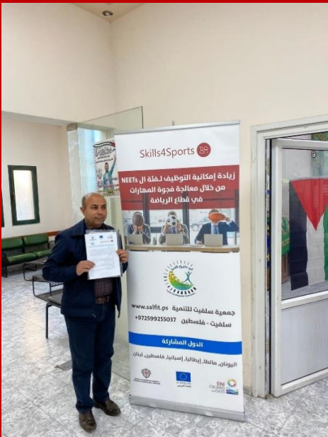
Salfit Development Association, Palestine: signing of memorandum for Skills4Sports Strategic Alliance in Palestine.