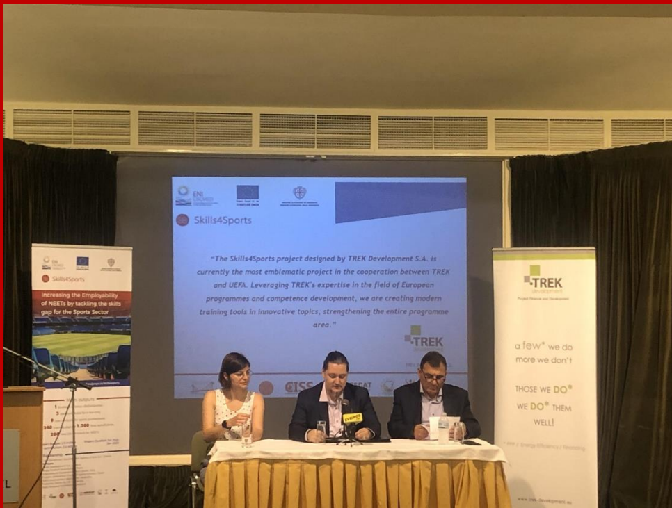
Press Conference implemented by the Development Agency of Evia with TREK Development S.A. in Chalkida, Evia.