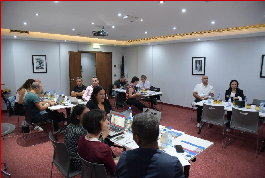
The Rene Moawad Foundation hosted a project meeting in Lebanon on the 4 th of October