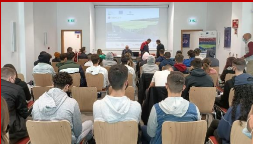
Malta Football Association (MFA) - Infoday at The Malta College of Arts, Science & Technology (MCAST) in Paola, Malta