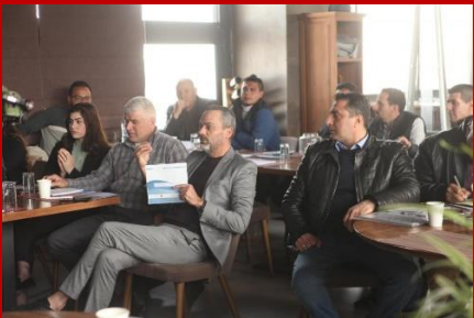
Palestine Sports for Life: signing of memorandum for Skills4Sports Strategic Alliance in Palestine.