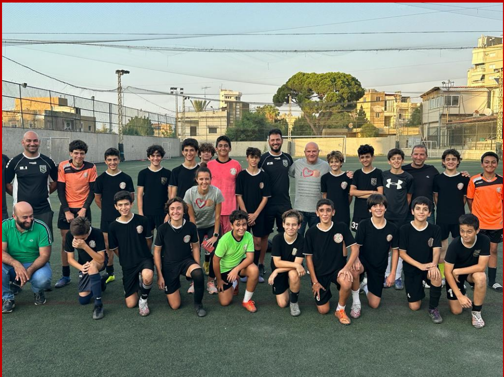
Skills4Sports partnership visited Sagesse Club SC in Beirut at the 6th of October 2022