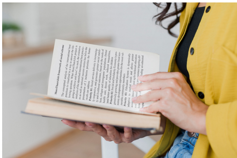
MoreThanAJob Framework for Social Schemes