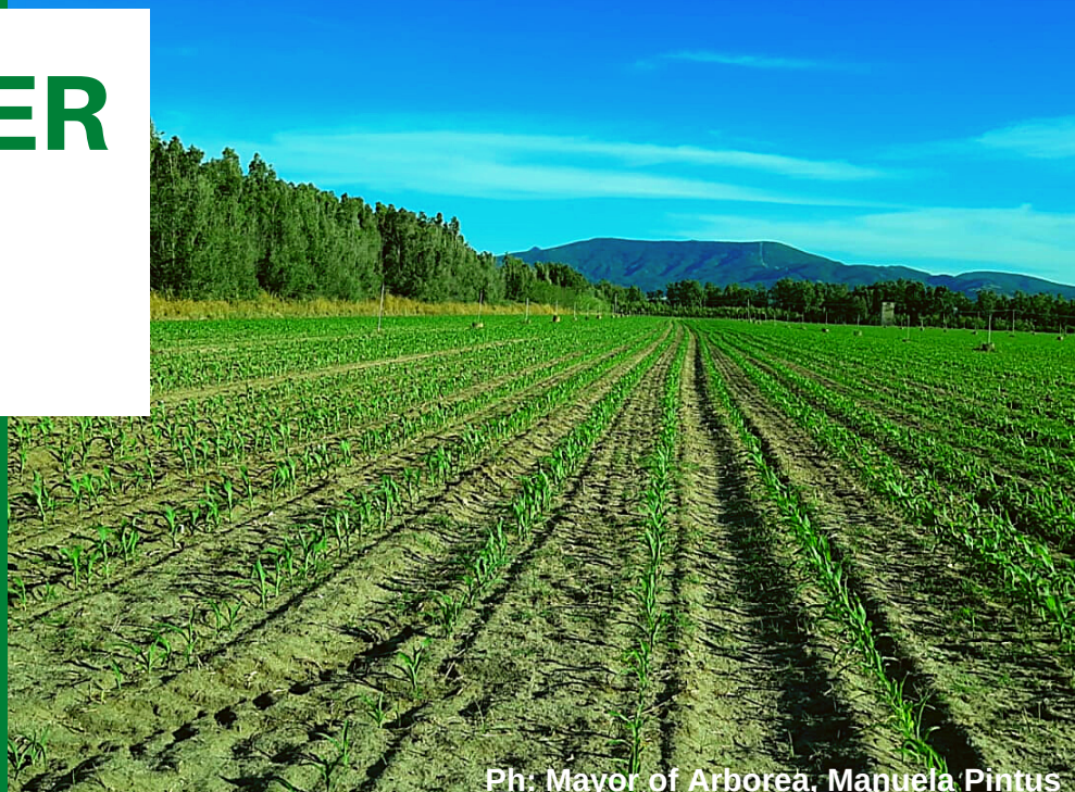
Ph: Mayor of Arborea, Manuela Pintus